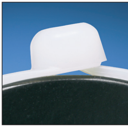
Low Installed Head Height