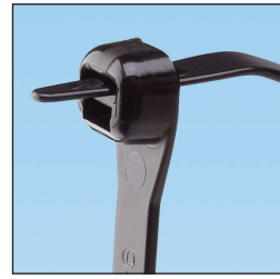
Tapered Tip with Aggressive Grips